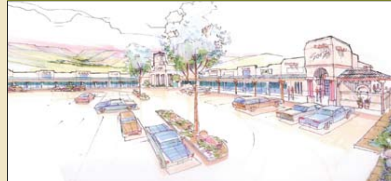
Kokopelli Plaza Rendering